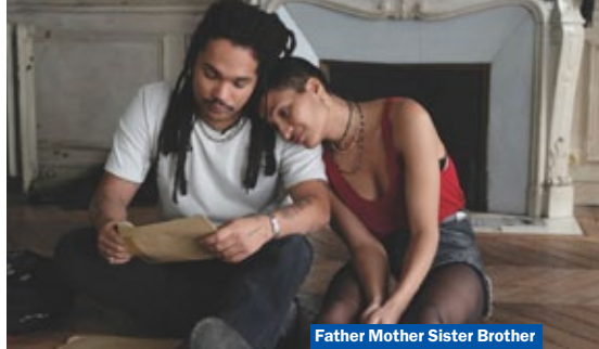
Father Mother Sister Brother