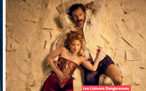
Les Liaisons Dangereuses