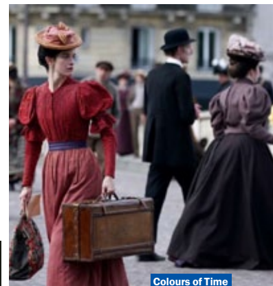
Colours of Time

A resolutely playful and feel-good reflection on the notion of modernity CINEUROPA