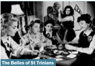
The Belles of St Trinians

High jinks a-plenty from both teachers and pupils as a new term begins at St Trinian's School for Young Ladies, an event that strikes terror into both local residents and police – but WPC Ruby Gates has got it covered.