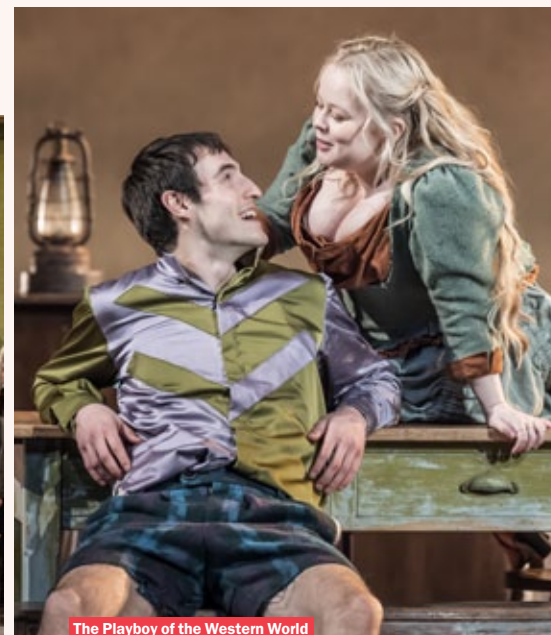
The Playboy of the Western World