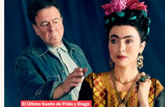
El Último Sueño de Frida y Diego