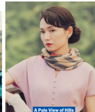
A Pale View of Hills

A wrenching contemplation of the 'undiscovered country' of death and grief EMPIRE