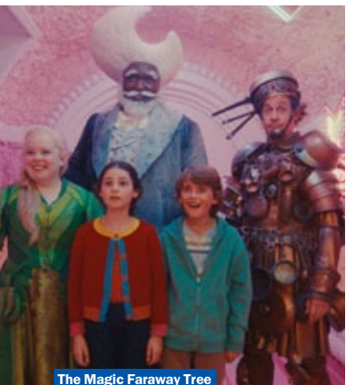
The Magic Faraway Tree

Charming, entertaining and uplifting MARK KERMODE