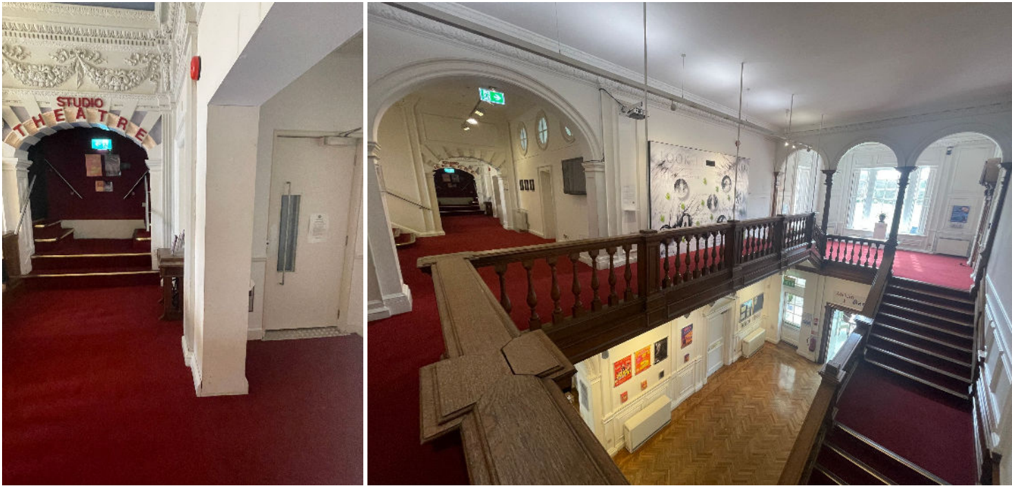
Studio theatre entrance (including wheelchair lift to right). First Floor: Access via main stairs and lift (near location of camera).