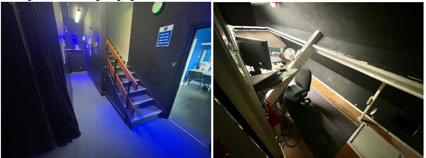
Backstage corridor & Dressing Room 2. Control box.