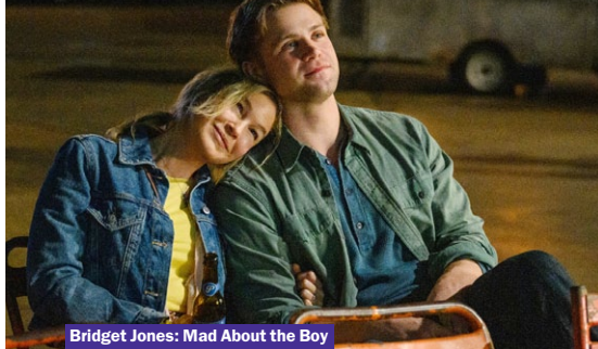
Bridget Jones: Mad About the Boy