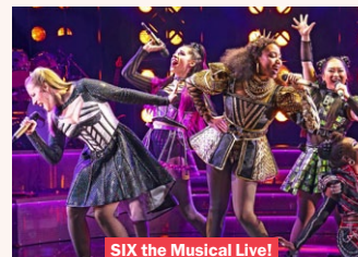
SIX the Musical Live!