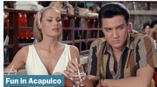
Fun in Acapulco

Elvis heads south of the border where he's fired as a boat hand, hired as a lifeguard and singer, admired by local beauties and inspired to jump off a 136-foot cliff. Sun-drenched classic with notable songs, Fun in Acapulco , Bossa Nova Baby , Marguerita and Guadalajara .