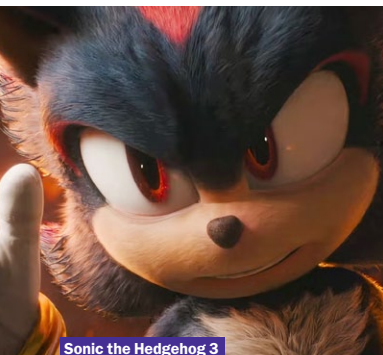
Sonic the Hedgehog 3

Fizzes with energy and laugh-out-loud moments RADIO TIMES