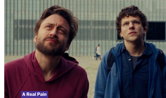
A Real Pain