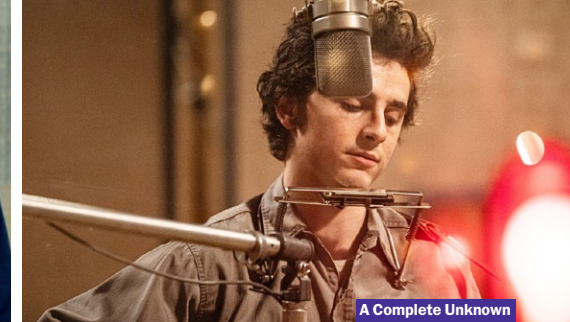
A Complete Unknown