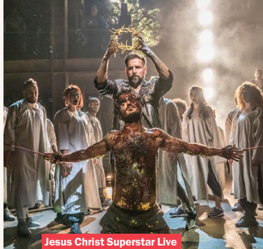
Jesus Christ Superstar Live