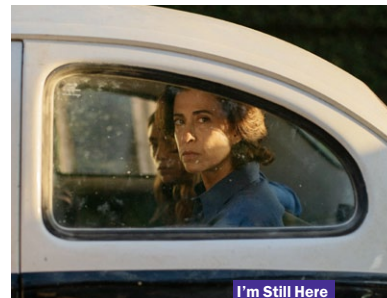
I'm Still Here

Black Bag, Day of the Fight, The Alto Knights, A Big Bold Beautiful Journey, Four Mothers, Disney's Snow White, A Minecraft Movie, When Autumn Falls, La Cocina