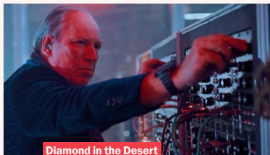
Diamond in the Desert

Capturing an extraordinary live performance of some of Zimmer's most revered compositions, including music from Dune , Gladiator , Interstellar , The Lion King and many more. The film offers viewers a rare glimpse into Zimmer's creative process, exploring his drive to create and the stories behind his closest collaborations, featuring conversations with Billie Eilish, Sir Christopher Nolan, Denis Villeneuve, Johnny Marr, Pharrell Williams, Timothée Chalamet and Zendaya. This unforgettable cinematic experience showcases the magic and storytelling power of Zimmer's music.