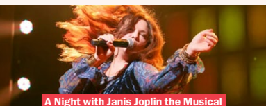
A Night with Janis Joplin the Musical

Janis Joplin exploded onto the music scene in 1967 to become queen of rock 'n' roll. Her unmistakable voice, filled with raw emotion, made her a must-see headliner from Monterey to Woodstock, with unforgettable numbers such as Me and Bobby McGee , Piece of My Heart and Mercedes Benz . This multi award-winning show, captured recently at the Sadler's Wells Peacock Theatre, is an extraordinary musical journey paying homage to Janis and her biggest musical influences – Aretha Franklin, Etta James, Nina Simone and Bessie Smith.