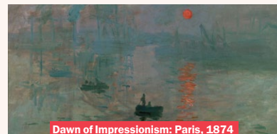
Dawn of Impressionism: Paris, 1874

Exhibition on Screen Michelangelo: Love & Death Wed 21 May 7pm