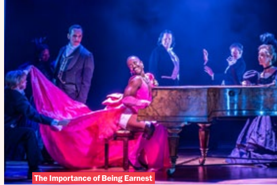
The Importance of Being Earnest