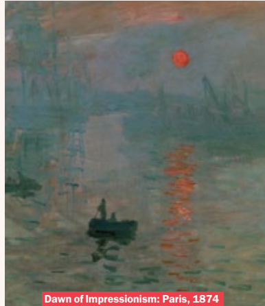
Dawn of Impressionism: Paris, 1874

Exhibition on Screen Michelangelo: Love & Death Wed 21 May 7pm