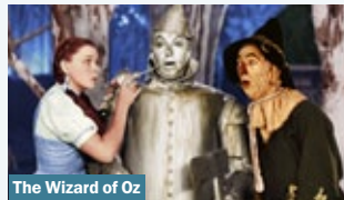
The Wizard of Oz

Dorothy Gale, swept from Kansas to the magical Land of Oz, seeks help from the Wizard with her new friends. Over the Rainbow, Follow the Yellow Brick Road and We're Off to See the Wizard are some of the timeless numbers in this delightful film.