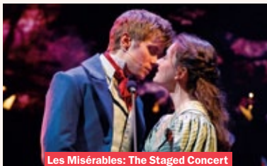
Les Misérables: The Staged Concert