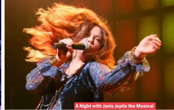
A Night with Janis Joplin the Musical