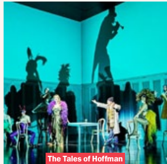
The Tales of Hoffman