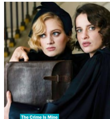
The Crime is Mine