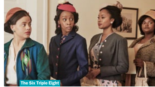
The Six Triple Eight

Bring your own crafting project and get creative as you enjoy a cosy film in our Cinema. Lights will be on so you can knit, sew, crochet, embroider or scrapbook during our new monthly special screening.