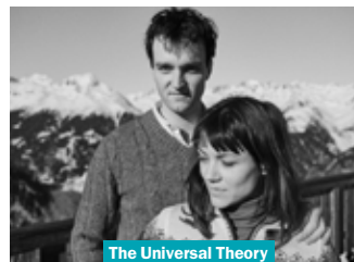
The Universal Theory