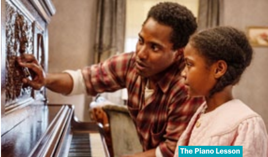
The Piano Lesson

The quietly magisterial Fiennes steals the show TIME OUT