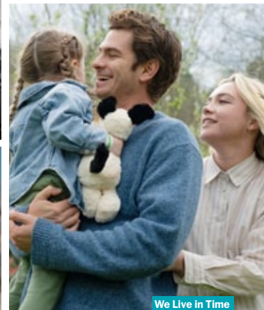
We Live in Time

A joy to watch two assured and natural performers at ease with both comedy and drama THE GUARDIAN