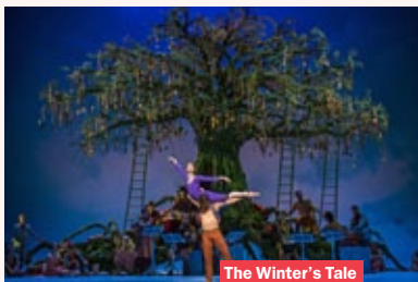
The Winter's Tale

Lift Off is our annual dance festival for local, national and international dance companies