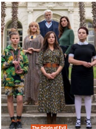
The Origin of Evil