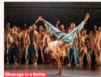
Message in a Bottle

The National Gallery is one of the world's greatest art galleries. It is full of masterpieces, an endless resource of history and an endless source of stories. But whose stories are told? Which art has the most impact and on whom? Much-loved celebrities, devoted staff members and world-class experts come together to paint a unique portrait of this iconic British institution for its 200th birthday, with heart-warming, moving and surprising stories.