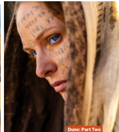
Dune: Part Two

Villeneuve shows mastery of scale and scope, with stunning cinematography and a thumping score RADIO TIMES