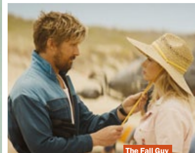
The Fall Guy

Two hours of zingers with impeccable timing, two bona fide movie stars with palpable chemistry and plenty of crazy stunts THE GUARDIAN