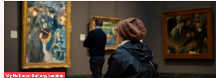
My National Gallery, London