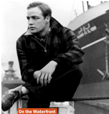
On the Waterfront

The supporting cast is wonderful, but it's Brando who lights up every part of this film THE TIMES