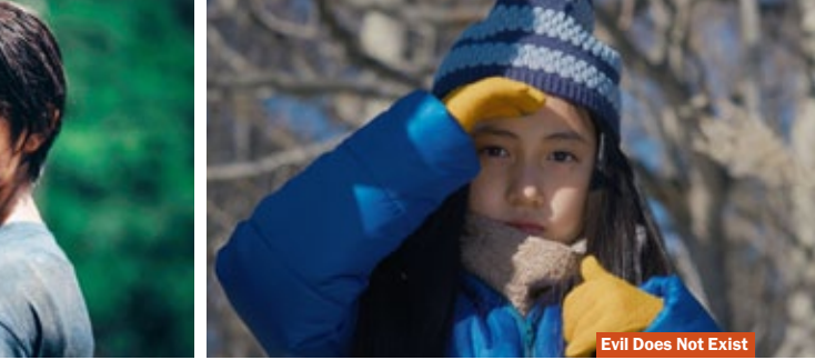
Evil Does Not Exist