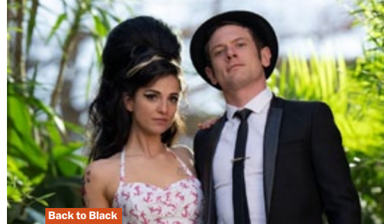
Back to Black