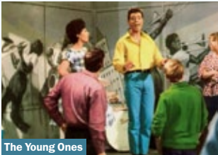
The Young Ones

Nicky and his friends raise money to save their youth club by recording a song as 'The Mystery Singer'. Join Cliff and The Shadows in memorable pop faves When the Girl in Your Arms , Living Doll , and of course, The Young Ones .