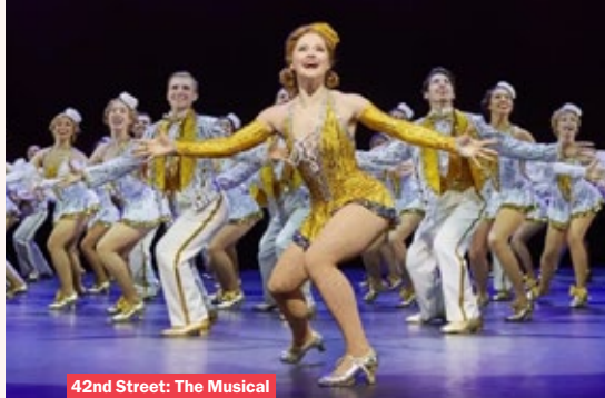
42nd Street: The Musical