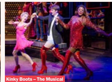
Kinky Boots - The Musical