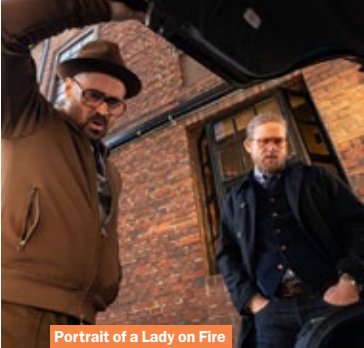
Portrait of a Lady on Fire