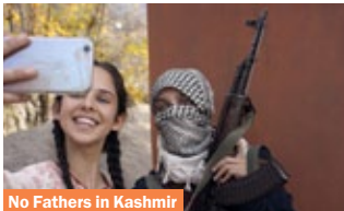
No Fathers in Kashmir

A teenage British Kashmiri retraces her roots but encounters terrifying hostility from many quarters. This powerful drama encapsulates the robbed childhoods and broken dreams of Kashmiri adolescents, and offers a dissenting perspective.