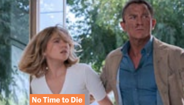
No Time to Die