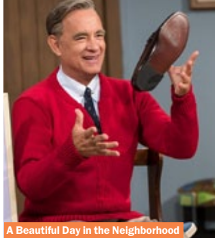
A Beautiful Day in the Neighborhood

A kind film told tenderly and seriously ROGEBERT.COM