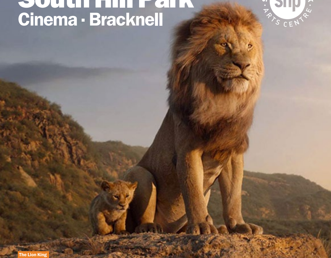
The Lion King