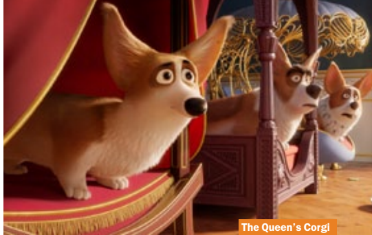
The Queen's Corgi