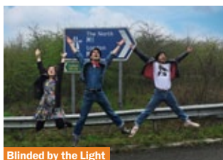
Blinded by the Light

1987, Thatcher's austere Britain. A teenager learns to live life and find his own voice through the music of Bruce Springsteen. Joyful story of courage, love, hope, family and the unique ability of music to lift the human spirit.