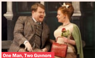
One Man, Two Guvnors

Fired from his skiffle band, Francis Henshall becomes minder to a small time East End hood. Featuring a Tony Award-winning performance from host of The Late Late Show , James Corden, this hilarious, uproarious West End and Broadway hit returns to cinemas to mark National Theatre Live's 10th birthday.