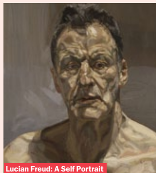
Lucian Freud: A Self Portrait

Exhibition on Screen Frida Kahlo Mon 6 Jul 7.30pm £12.50, Conc £11.50 Members £10.50