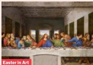
Easter in Art

Released on the 500th anniversary of his death, Leonardo's Full Story presents every single attributed painting in Ultra HD quality, as never seen before on the big screen. With commentary by the world's leading experts, key works examined include: The Mona Lisa, The Last Supper, Lady with an Ermine, and Virgin of the Rocks.