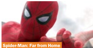
Spider-Man: Far from Home

Spider-Man must step up to take on new threats in a world that has changed forever. Keeping things light and fun Holland gives another top performance full of awkward teenage energy.