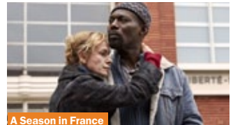
A Season in France

Beneath Anna Poliatova's striking beauty lies a secret that will unleash her indelible strength and skill to become one of the world's most feared government assassins. A non-stop thrill ride of breath-taking action.