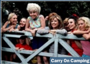
Carry On Camping