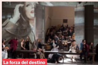
La forza del destino

Set in 1860s Bangkok, the story of the unconventional and tempestuous relationship that develops between the King of Siam and Anna, a British schoolteacher. With one of the finest scores ever written including Whistle a Happy Tune , Getting to Know You , and Shall We Dance , and starring Kelli O'Hara and Ken Watanabe.