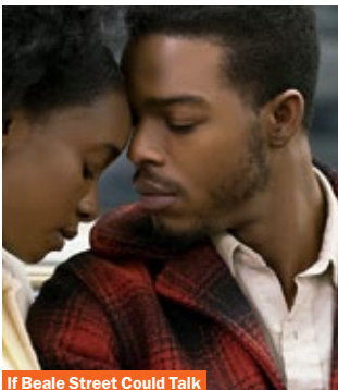
If Beale Street Could Talk

A savage satire of Israeli military grief and grind SIGHT&SOUND