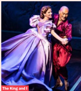
The King and I

Gounod's opera remains one of the most constantly enthralling versions of the story of Faust, who trades his soul with the Devil for youth and power. Set in 1870s Paris, virtuoso leading roles, a large chorus, sensational sets and an ecstatic finale make this the epitome of theatrical spectacle.