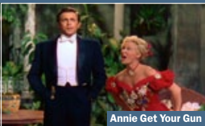
Annie Get Your Gun

Musical story of Wild West sharpshooter Annie Oakley. An abundance of memorable numbers includes I've Got the Sun in the Morning , There's No Business Like Show Business , Doin' What Comes Natur'ly and Anything, You Can Do .