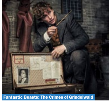
Fantastic Beasts: The Crimes of Grindelwald