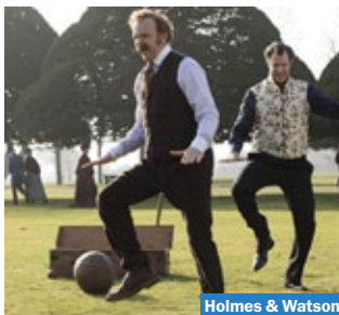
Holmes & Watson

With an inspired all-star cast, this is a distinctly silly (in a good way) comedic take on the famed literary characters as they use their brilliant minds to stop Moriarty from assassinating the Queen.