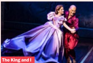
The King and I

Set in 1860s Bangkok, the story of the unconventional and tempestuous relationship that develops between the King of Siam and Anna, a British schoolteacher. With one of the finest scores ever written including: Whistle a Happy Tune, Getting to Know You, and Shall We Dance , and starring Kelli O'Hara and Ken Watanabe.