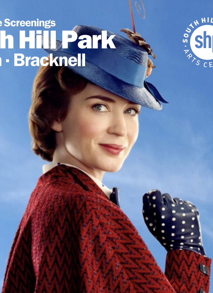
Mary Poppins Returns