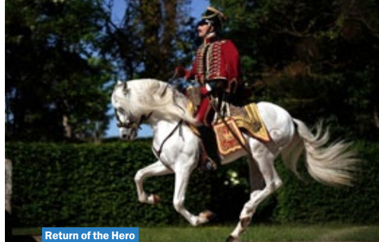
Return of the Hero