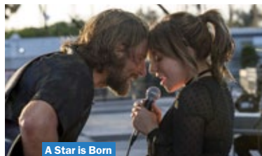
A Star is Born

Musical story of Wild West sharpshooter Annie Oakley. An abundance of memorable numbers includes I've Got the Sun in the Morning , There's No Business Like Show Business , Doin' What Comes Natur'ly and Anything, You Can Do .